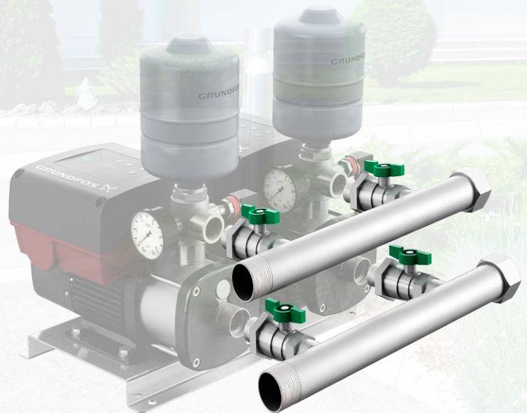
Inlet/Outlet Pipe kit for CMBE TWIN