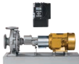
Etanorm SYT, KSB SuPremE®-IE5 motor*, wall-mounted PumpDrive