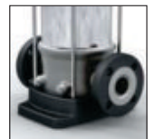
Round flange Movitec VSF