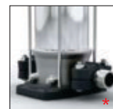
Victaulic coupling Movitec V(S)V