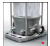
External thread con- nector Movitec VE