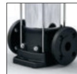
Round flange Movitec VCF

* Can be made available from KSB Netherlands on request