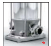
Triclamp coupling Movitec V(S)T

* Can be made available from KSB Netherlands on request