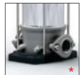
Oval flange Movitec VS