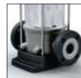
Round flange Movitec VF